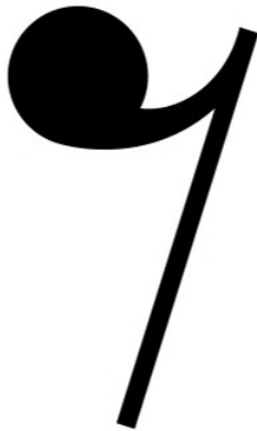
EIGHTH REST (Quaver Rest)

A squiggly symbol (looks like a stylized "3" or lightning bolt). It means silence for 1 beat (the length of a quarter note) in 4/4 time