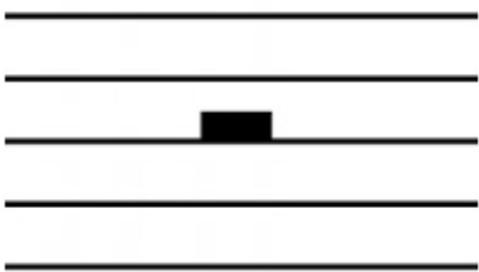
HALF REST (Minim Rest)

A small filled rectangle hanging from the second staff line. It means silence for 4 beats (the length of a whole note) in 4/4 time. A whole rest filling an entire bar.