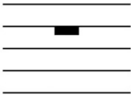
WHOLE REST (Semibreve Rest)

A small filled rectangle hanging from the second staff line. It means silence for 4 beats (the length of a whole note) in 4/4 time. A whole rest filling an entire bar.