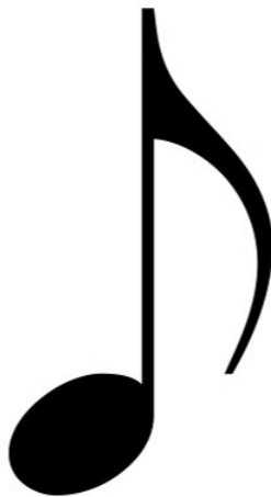
EIGHTH NOTE (Quaver)

A filled (black) oval with a stem. It lasts 1 beat in 4/4 time. This is the standard "one-beat" note in common time.