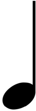
QUARTER NOTE (Crotchet)

A filled (black) oval with a stem. It lasts 1 beat in 4/4 time. This is the standard "one-beat" note in common time.